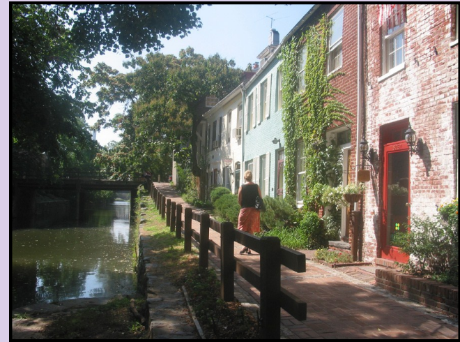
Canal Walk in Georgetown

The conference hotel is located at the border of Georgetown which offers hip restaurants and boutiques as well as the premier waterfront area of the District, National Harbor. A metro stop is only a five minute walk from the hotel so no place is difficult to access.